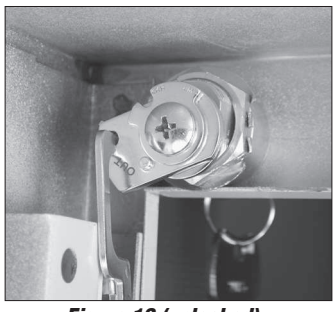
Figure 12 (unlocked)