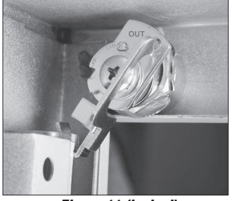
Figure 11 (locked)