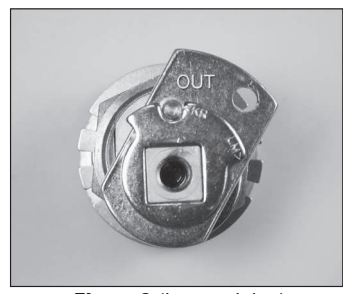
Figure 9 (key retaining)