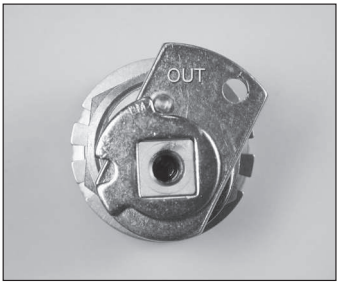
Figure 8 (non key retaining)